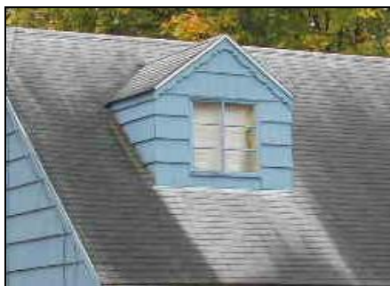
Extensive algae growth

Algae require moisture and proper temperatures to grow. Dew is the primary moisture source. Algae are found predominantly in the Southeast, but it can and will grow nationwide. The algae generally grow on the northern exposures of the roof since this exposure generally receives less sunlight. Algae are well adapted to extreme conditions.