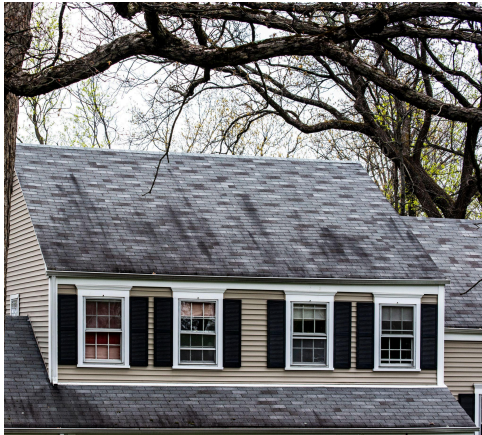
Blue-Green Algae Growth

Blue-green algae requires moisture and proper temperatures to grow. Dew is the primary moisture source. Blue-green algae grows across the U.S. and Canada. Blue-green algae generally grows on the northern exposures of the roof since this exposure generally receives less sunlight. Blue-green algae is well adapted to extreme conditions.