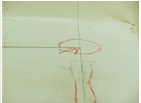
Fig. 2: Marking Voids

GAF Technical Services Can Assist You... with these and other questions you may have regarding your new roof installation. Technical Support Services can be contacted at 800-766-3411. The GAF website is a great resource for just about any question you may have or for additional information you may require. Please visit www.gaf.com to find the latest information on our products and their installation.