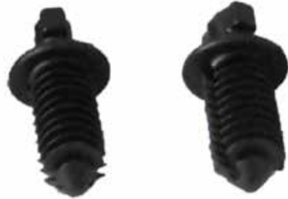
Polypropylene with Natural UV Inhibitor

GRO Fastening Kits for use with GRO Wood Deck Tiles provide a secure connection between pedestals and the finished deck surface. The weight of the deck pavers create a monolithic system to hold the system in place and mitigate against wind uplift.