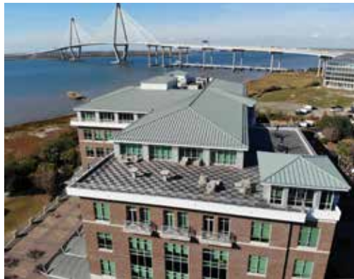
GRO Ipe Wood Deck Tiles with GRO Hidden Fasteners