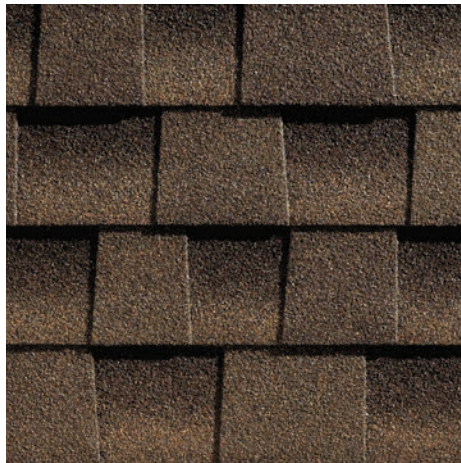
Beautiful finished look It's the same Timberline® Shingle you know and love, now even better