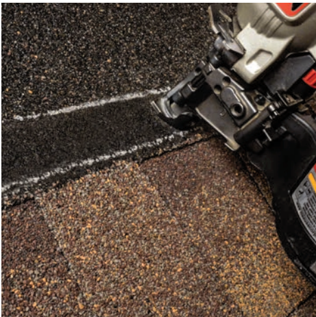
LayerLock™ Technology Powers the industry's widest nailing zone