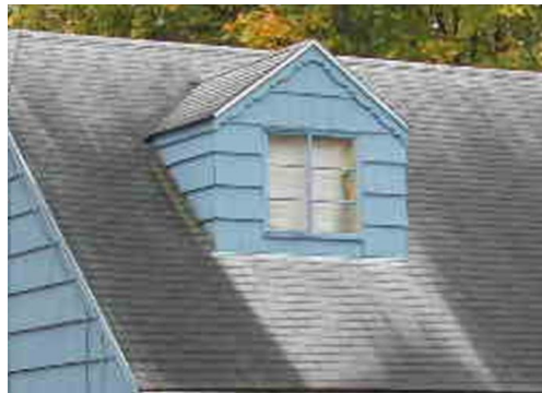
Extensive Algae Growth

Algae require moisture and proper temperatures to grow. Dew is the primary moisture source. Algae are found predominantly in the Southeast, but it can and will grow nationwide. The algae generally grow on the northern exposures of the roof since this exposure generally receives less sunlight. Algae are well adapted to extreme conditions.