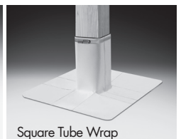
Square Tube Wrap

Quality You Can Trust... From North America's Largest Roofing Manufacturer! ™