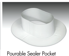
Pourable Sealer Pocket