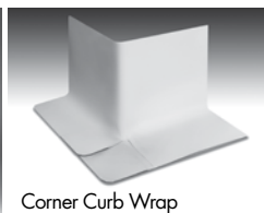
Corner Curb Wrap