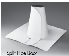
Split Pipe Boot