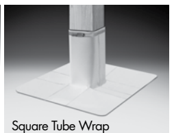
Square Tube Wrap

Quality You Can Trust... From North America's Largest Roofing Manufacturer!™