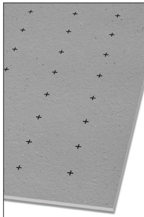
EnergyGuard™ HD and HD PLUS Polyiso Insulation