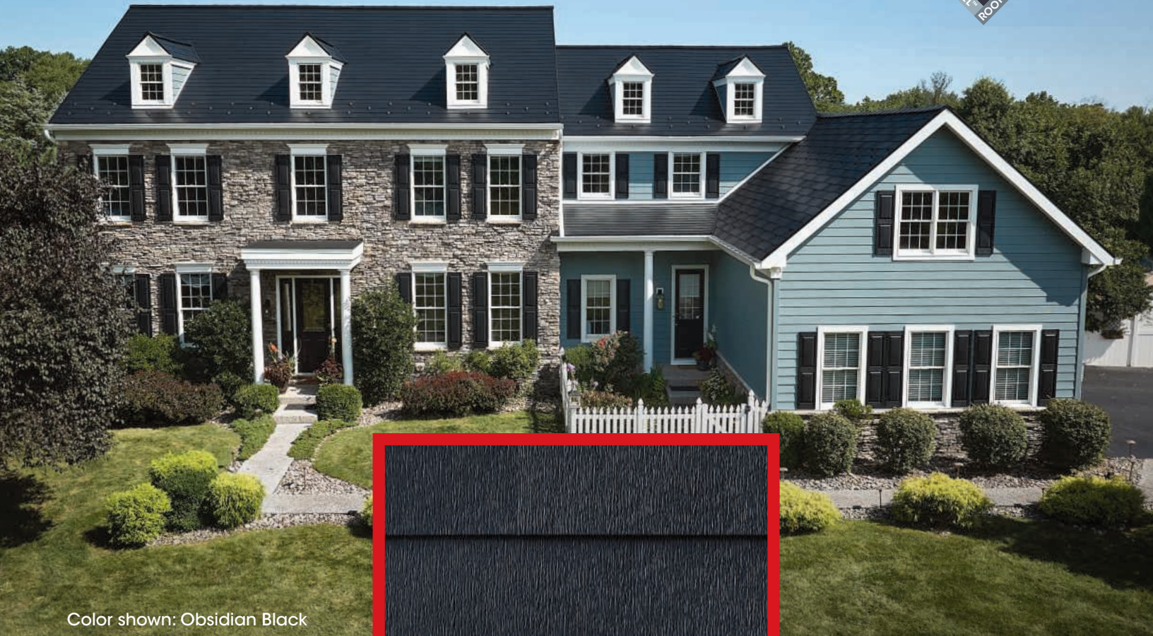
Color shown: Obsidian Black