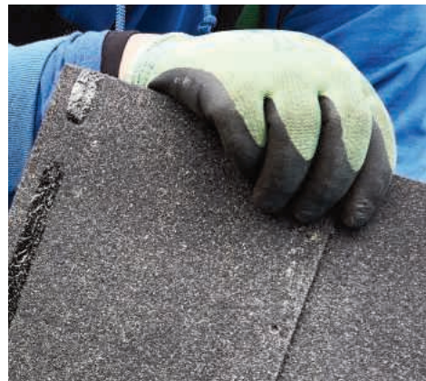
LayerLock® Technology — proprietary technology mechanically fuses the common bond between overlapping shingle layers.