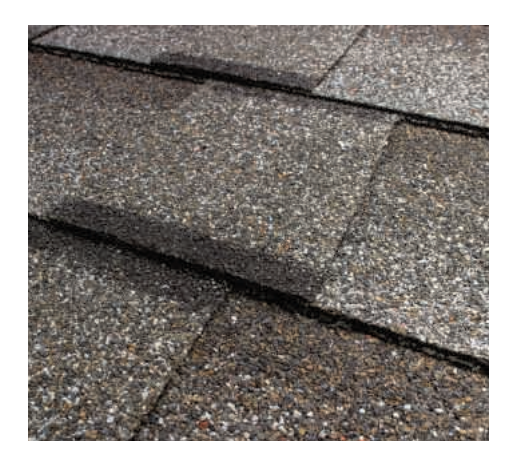
Dual Shadow Line technology precisely distributes color granules to create two parallel shadow lines, which gives the Timberline UHDZ® shingle a thick, ultra-dimensional wood-shake look.