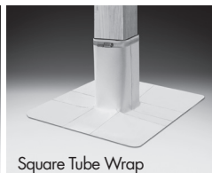
Square Tube Wrap