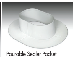
Pourable Sealer Pocket

Quality You Can Trust...From North America's Largest Roofing Manufacturer! ™