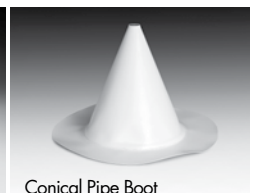
Conical Pipe Boot

Quality You Can Trust... From North America's Largest Roofing Manufacturer!™