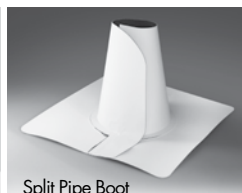
Split Pipe Boot