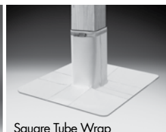
Square Tube Wrap