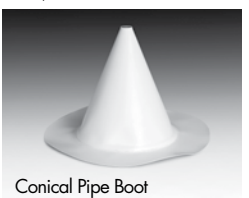
Conical Pipe Boot

Quality You Can Trust... From North America's Largest Roofing Manufacturer!™