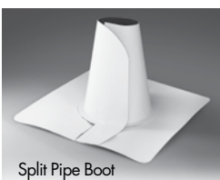
Split Pipe Boot