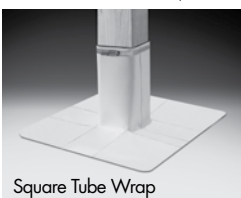
Square Tube Wrap