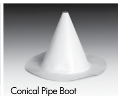
Conical Pipe Boot