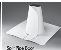
Split Pipe Boot