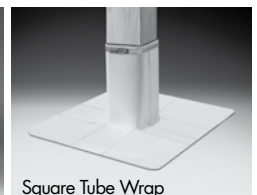
Square Tube Wrap

Quality You Can Trust... From North America's Largest Roofing Manufacturer!™