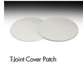
T-Joint Cover Patch