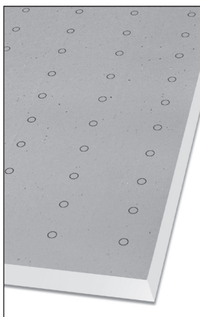
EnergyGuard™ NH Polyiso Insulation

(2) These numerical ratings are not intended to reflect hazards presented by these or any other material under actual fire conditions.