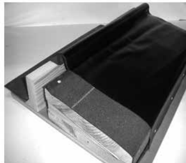
CMF with Wide Curb one side