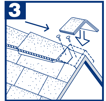
Cover... the tabs of the last Vented RidgeCrest™ piece fabric with two layers of shingle fabric or a trimmed piece of Vented RidgeCrest™.