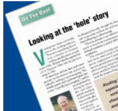
RSI (Roofing, Siding, Insulation) Magazine, October 2000

"...pressure can be dissipated laterally through the...granules without the roof membrane blistering or delaminating."