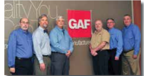
The GAF Field Services Management Team manages 45 full-time field services professionals, most of whom have 25-30 years of roofing experience!

So whether you prefer one-on-one service or a self-service option through our new Architect and Specifier portal at GAF.com , we're here to help make your next project a success.