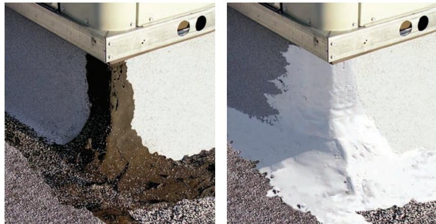
SeamCote™ coating will hide the asphalt bleed-out on base or curb flashings—but an even better option is to first apply a TopCoat® flashing grade sealant, followed by SeamCote™ coating.