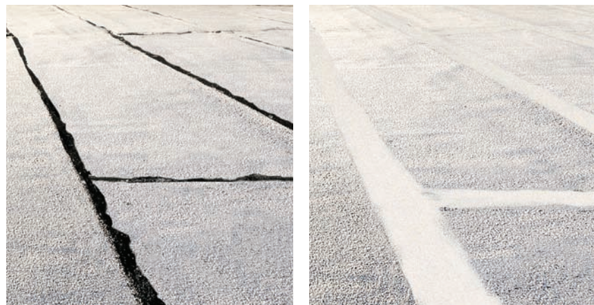
A single application of SeamCote™ coating can hide the asphalt bleed-out on your BUR or MB roof.