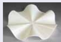
Fluted Outside Corner