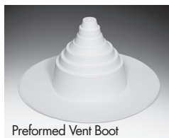
Preformed Vent Boot