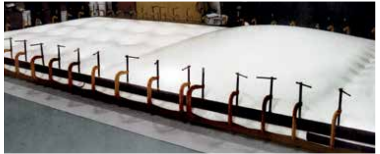
The RhinoBond® welded membrane spreads the wind load evenly across the roof (left, above) as opposed to the traditional in-seam fastening method (right, above), leading to less flutter – especially with wide sheets.